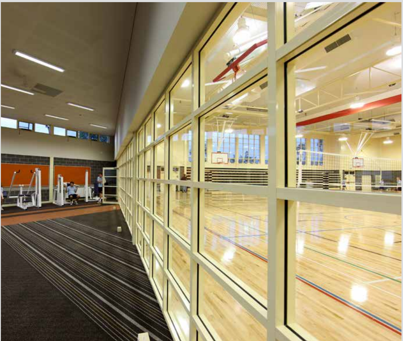
/ Scotts School, Scotts School, Albury. NBRSP Architects. Windows by DLG Aluminium & Glazing.

These systems are tested by the National Acoustic Laboratories to provide the highest level of assurance in their performance integrity.